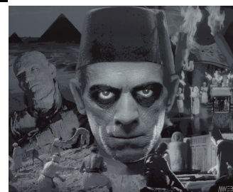
The Unhinged Romantic

Fine Art Giclee Reproductions available at the River Art Gallery & Gift Shop