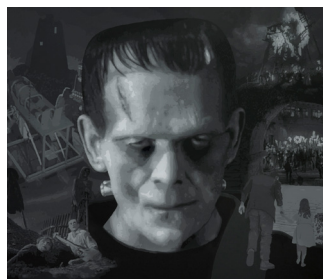
The Uncanny Monster

archival inks and placed inside an archival plastic sleeve. Stop by River Art Gallery and Gifts to view these original paintings. Pick up one or both of these Thrilling Classics and add them to your collection. michaelweberarts.com FRANKENSTEIN: The Boris Karloff Years - Cinema Scholars